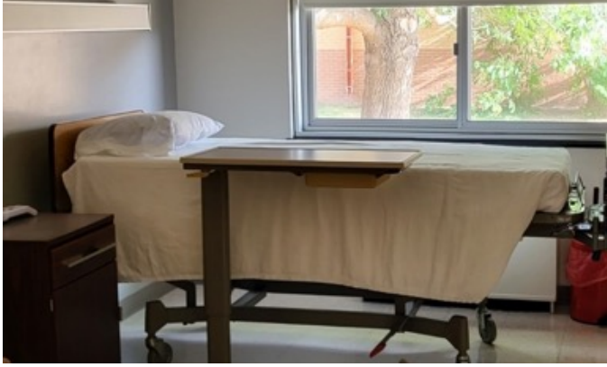
A swing bed at Towner County Medical Center, a Critical Access Hospital in Cando, North Dakota. The bed can be used for both acute care and post-acute care services.

To be eligible for swing bed care, Medicare rules require that a beneficiary must have a qualifying 3-day inpatient stay in a qualified hospital or CAH prior to admission to a swing bed. 6,7 The 3-day qualifying stay does not need to be in the same hospital as the swing bed admission. 6,7 This allows patients who receive acute care far from home the flexibility to transition to a swing bed that is closer to their residence.